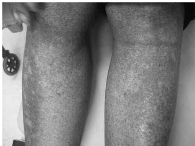
Figure 1. Possible drug eruption with extensive petechiae.

None of the other 12 patients treated with febuxostat