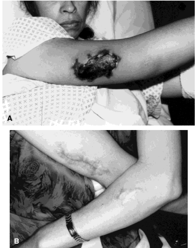
Fig. 1. (A) Area of total thickness skin necrosis covered by thick black eschar over the right arm. (B) Healed areas of skin necrosis showing irregular scarring.

To the Editor: We read with interest the paper by Essex et al. [1] on late-onset warfarin-induced skin necrosis. The authors mention the inad-