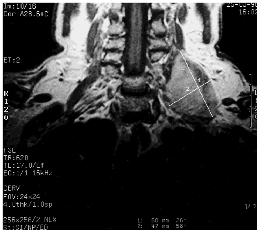
Fig. 1. Magnetic resonance imaging of desmoid tumor infiltrating the left cervical region (patient 2).

A 50-year-old man had diagnosis of CLL (CD5+ 19+ 21+ 23+ 24+ Dr+ TQ1+ FMC7-) in 1987. He was treated with chlorambucil from 1988 to 1997. In April 1996, a large rapidly growing cervical mass developed and the diagnosis of Richter's syndrome was evoked. A surgical biopsy was performed, and a desmoid tumor was diagnosed. Complete surgical resection was performed after magnetic resonance imaging (Fig. 1). The tumor cells stained with vimentin and actin, and exhibit a normal karyotype. The CD4 cell count was 1.41 \times 10^9/l . The karyotype performed on peripheral blood lymphocytes disclosed 46XY, del(9)(q11). A colonoscopic exam