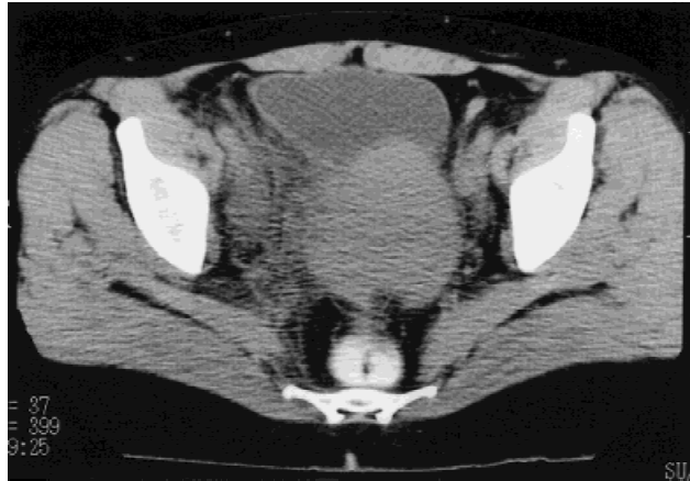
Fig. 1. Abdominal CT scan showing infiltration of uterus and para-uterine tissues.

chemistry was as follows: CRP 20.2 mg/L, proteins 62 g/L, LDH 836 U/L. Blood cell counts were: Hb 12.5 g/dL, Ht 36% (MCV 90.3), WBC 86.2 \times 10^9/L with 10% neutrophils, 1% eosinophils, 1% lymphocytes, and 88% blasts (exhibiting a high nucleocytoplasmic ratio, a basophilic cytoplasm, a cleaved cell nucleus but no Auer rods), and thrombocytes 131 \times 10^9/L .