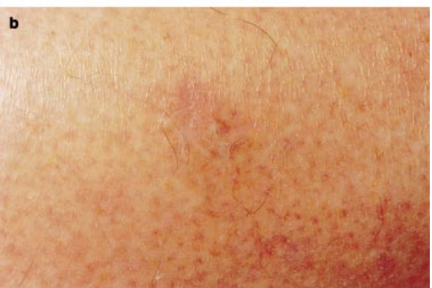
Figure 1. (a) Lesion of porokeratosis of Mibelli on the right leg; (b) resolution of the lesion after imiguimod therapy.

uracil,4 etretinate,5 carbon dioxide laser,6 cryosurgery, electrocautery and excision. While surgical excision is the most definitive approach, this can be technically difficult in some cases, depending on the site, size and number of lesions. It is recognized that immunosuppression may favour the development of porokeratotic lesions. 7,8 T-helper (Th) 1 cells are the principal cells required in immune surveillance, and imiquimod has been shown to induce cytokines such as interferon (IFN)- \gamma , IFN- \alpha , tumour necrosis factor- \alpha and interleukin 12, which promote a Th1-type cell-mediated immune response.<sup>9,10</sup> The lack of response without occlusion would suggest that imiquimod cream is unable to penetrate the lesion sufficiently. The improved response following occlusion was probably due to the effect of increased hydration of the stratum corneum allowing increased penetration of the drug. Although it is possible that occlusion alone would have proved therapeutic in this condition, we think that this is unlikely. The pleasing response observed in our patient to topical imiguimod cream suggests that it may be a novel treatment option worth considering for porokeratosis of Mibelli. However, more extensive investigation of efficacy and tolerability needs to be done to determine the role of imiguimod cream in the treatment of this condition.