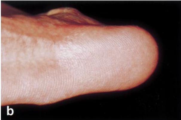
Figure 1. Clinical aspect of plantar pustular psoriasis before (a) and after (b) 3 weeks of treatment with leflunomide 10 mg daily.