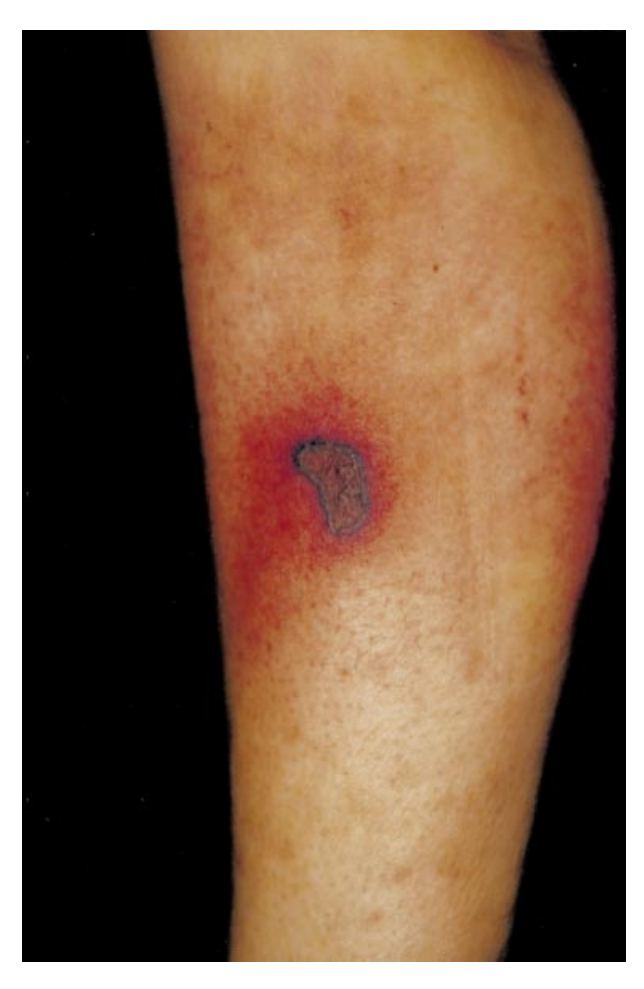
Figure 1. Patient 2: necrotic lesion on the leg after one injection of etanercept (this is not the injection site).

The mechanism of action of etanercept is competitive inhibition of TNF- \alpha binding to cell-surface receptors, preventing TNF- \alpha -mediated cellular responses by rendering TNF- \alpha biologically inactive. The pathway whereby this drug may induce autoantibody production and autoimmune disease remains unclear. Etanercept acts on inflammation but does